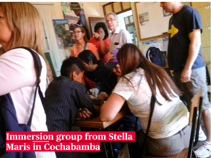
Immersion group from Stella Maris in Cochabamba