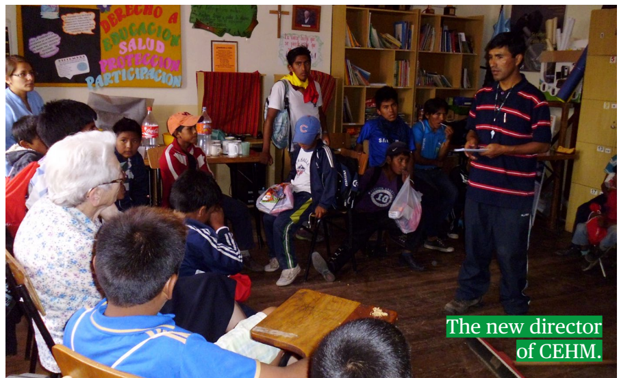
The new director of CEHM.