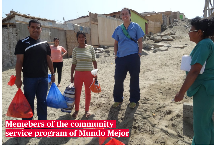
Members of the community service program of Mundo Mejor