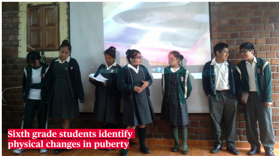
Sixth grade students identify physical changes in puberty