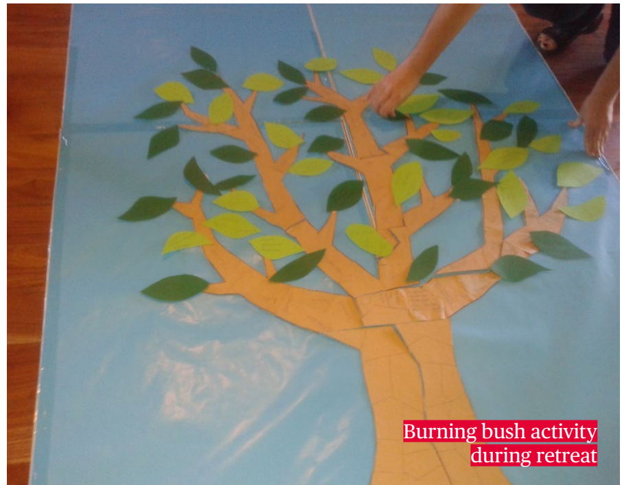
Burning bush activity during retreat