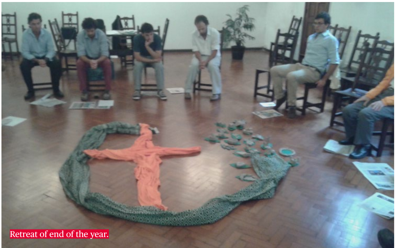
Retreat of end of the year.