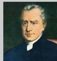
Bl. Edmund Rice

"Never allow vain notions of your own sense, abilities, or other natural or acquired qualifications to take root in your mind, but always beseech God to make known to you, your sins and imperfections."