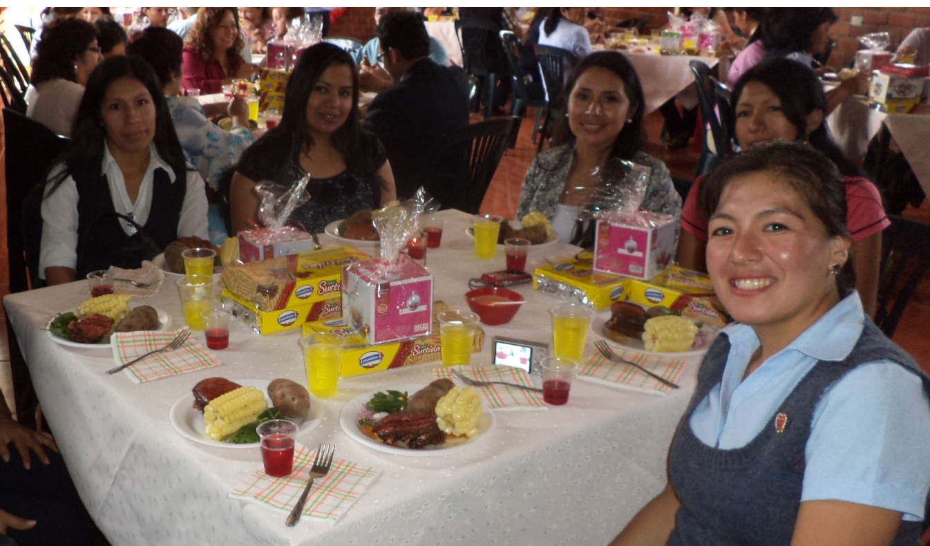
PHOTO: Group of teaching mothers of Fe y Alegría High School..