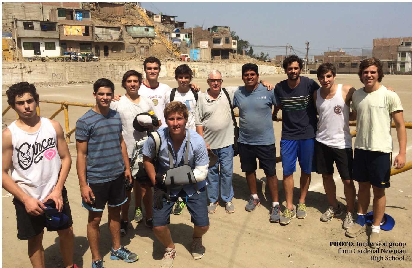
PHOTO: Immersion group from Cardinal Newman High School.