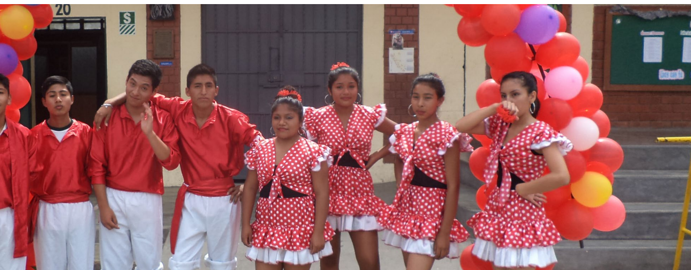
PHOTO: Students of Fe y Alegría High School, Lima.